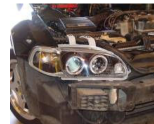
Step 20: Bolt on the headlight and test all functions before driving.