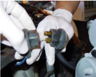
Step 18: Now plug in the new conversion wire harness into the new Anzo head light.