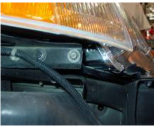
Step 10: Now remove the last screw under the corner light.