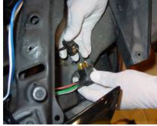
Step 14: Plug in one side of the Anzo conversion harness to the original headlight wire harness.