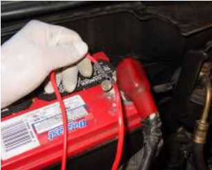
Step 16: Connect the power connectors to the battery.