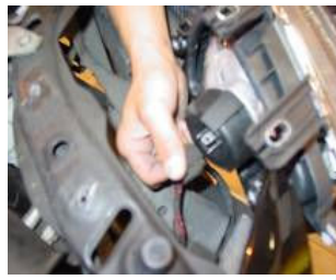
Step 12: Remove the headlight wire harness from the stock headlight.