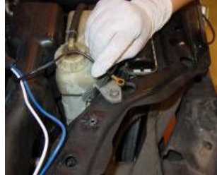
Step 15: Find a location for the ground wire, make sure this connector is to the body frame