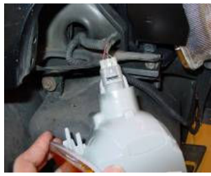
Step 11: Take off the corner light and remove the bulb.