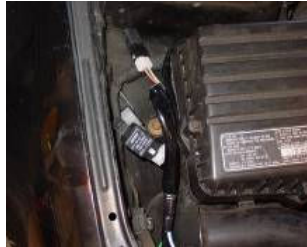
Run the wires to the side of the body out of the engine bay.