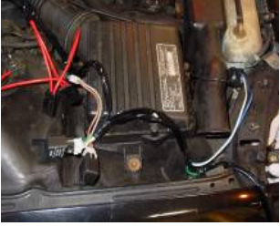
Step 13: Configure the headlight conversion wire harness near the battery.