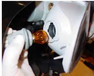
Step 19: Twist in the corner light bulb.