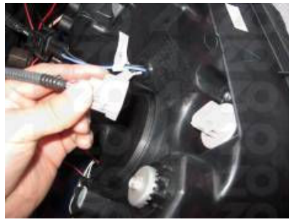
Step 20: Plug in the turn signal wire harness.