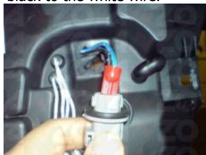
Step 17: If the leds do not turn on twist off the led parking socket and reverse the connection on the head light.