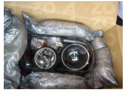
Step 12: Take out the new Anzo headlight from the box.