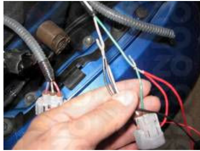
Step 14: Now splice the red wires to the green wire on the stock wire harness and the black to the white wire.