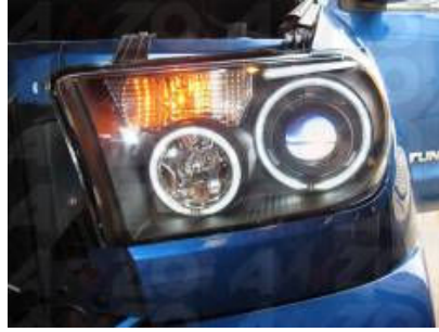
Step 22: Test all functions to make sure they are working properly before driving.