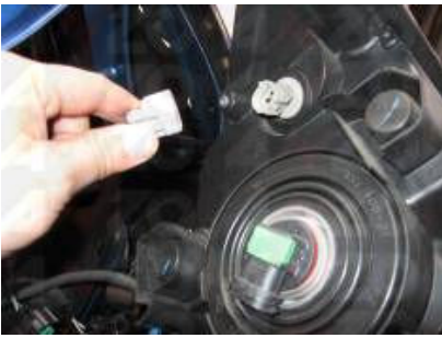
Step 10: Unplug the wire harness for the parking lights.