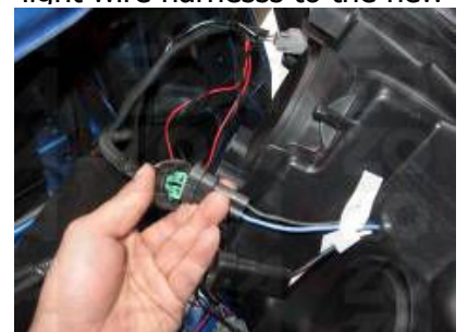
Step 18: Plug in the low beam wire harness.