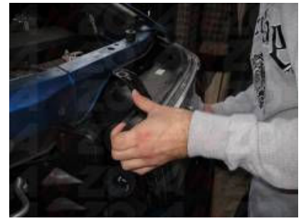
Step 21: Put the new Anzo headlight into the vehicle.