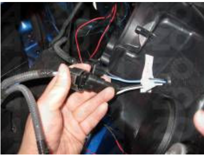
Step 19: Plug in the high beam wire harness.