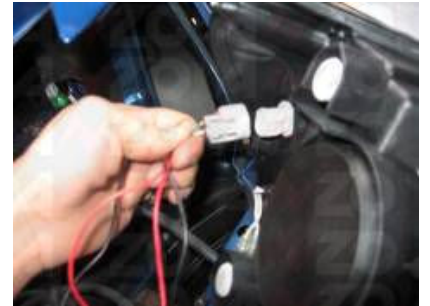
Step 15: Use the electrical tape to wrap up the exposed wires and plug in the parking light wire harness to the new