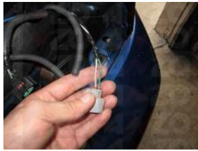
Step 11: Pull back the cover to expose the wires for the parking lights.