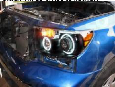
Step 16: Turn on the parking lights to make sure the halos and leds are working properly.