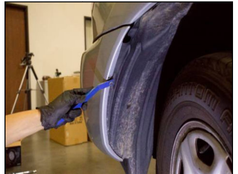
Remove lower push tab on inner fender well. Repeat on other side.