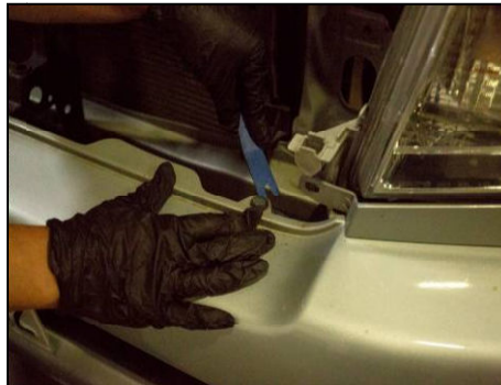
Remove 3 push tabs from top of bumper.