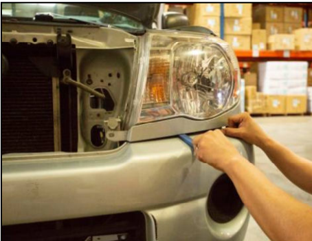
Use panel popper under headlight trim to release tab and remove trim. Repeat on other side.