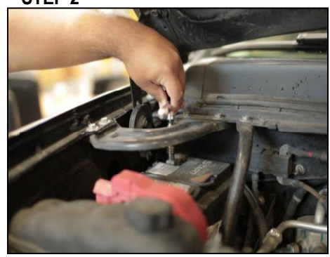
Remove negative battery terminal.