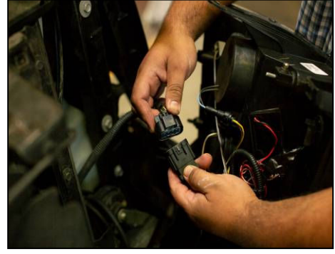
Connect main wire harness to Anzo USA headlight.