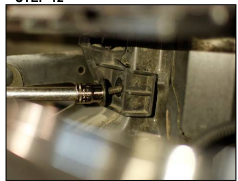
Remove lower 10mm headlight bolt under headlight.