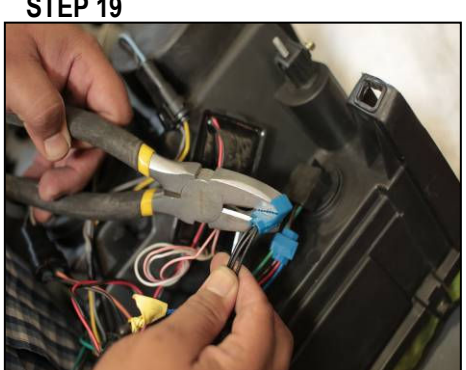
The two black wires will splice to the black wire on the same parking/turn signal socket.