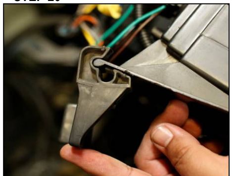
Transfer factory headlight bracket mount to Anzo USA headlight.