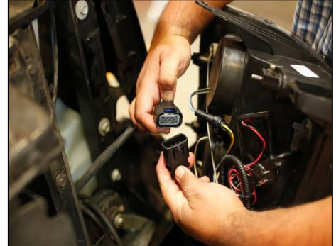
Disconnect main wiring harness from factory headlight.