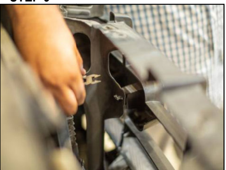
Use needle nose pliers to release both clips from radiator grill. Remove grill and set aside.