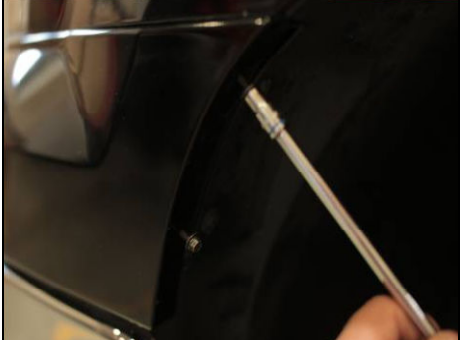
Remove two 7mm bolts on driver's side fender well. Repeat on opposite side.