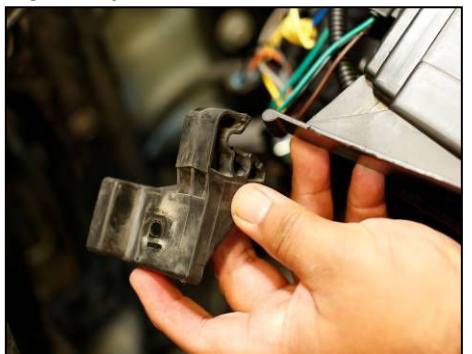
Separate lower headlight mount from factory headlight and set aside.