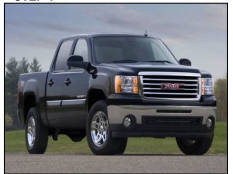
Factory GMC Sierra headlight