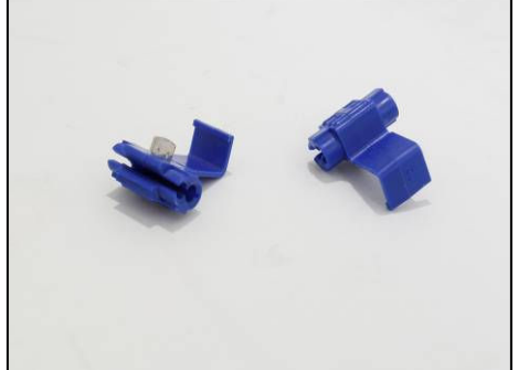
You may need to purchase quick splice connectors at any local auto parts store to splice the wiring.