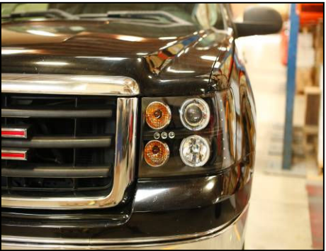
Repeat steps 10-22 to install opposite headlight then reverse steps 2-9 to finish installation.