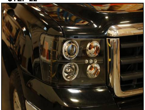
Slide headlight into bucket and reverse steps 10-12 to install headlight.