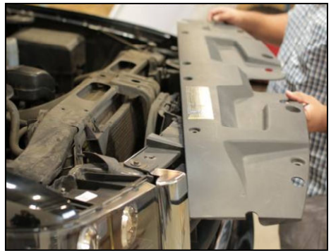
Remove factory radiator shroud and set aside.