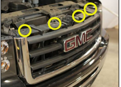
Remove four 10mm bolts from top of radiator grill.