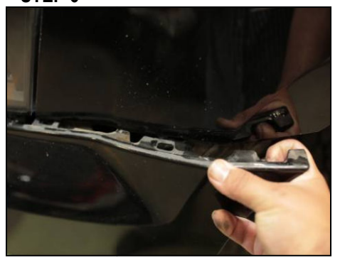
Pull front fascia outward and forward to unclip from fender. Repeat on opposite side.