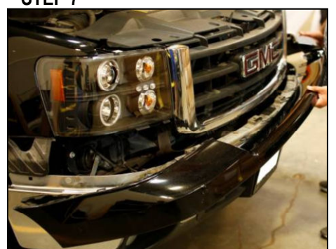
Remove front fascia and set aside.