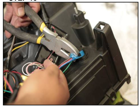
The red and blue wires will splice to the center brown wire on the parking/turn signal socket.