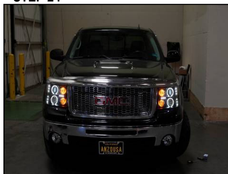
Make sure all functions of headlight work before operating vehicle.