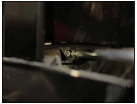
Remove outside lower 10mm headlight bolt by fender.