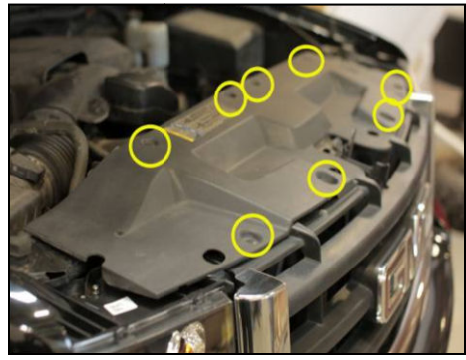
Use panel popper to remove 8 body panel clips on radiator shroud.