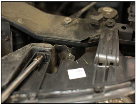
Remove two 10mm bolts on top of headlight.