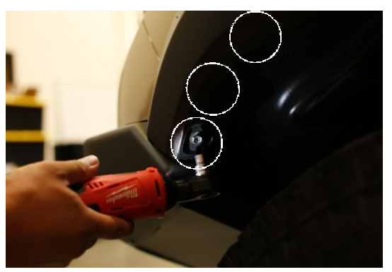
Step 7: Remove 10mm bolt and two plastic tabs from fender inner (Repeat process on other side)