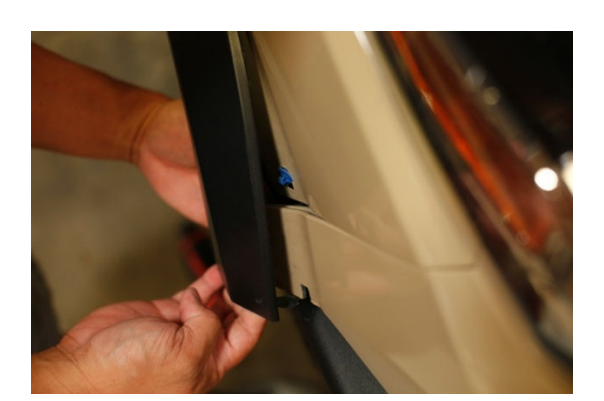
Step 8: Gently pop out fender trim from bumper (Repeat process on other side)