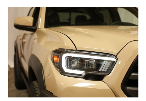
Step 16: Reconnect the negative lead cable to the battery terminal. Check for proper headlight function before driving vehicle

AnzoUSA ^{\text{TM}} products are covered, by a limited one (1) year warranty, to be free of manufacturer's defects. However, certain AnzoUSA ^{\text{TM}} product categories have warranty policies which differ from this standard, please contact your representative for detailed category information. Damage due to improper installation or road hazards is not covered. Seller and manufacturers' only obligations shall be to replace the product proven to be defective. Neither seller nor manufacturer shall be liable for any injury, loss or damage, direct or consequential, arising out of the use of or the inability to use the product. Before using, user shall determine the suitability of the product for its intended use, and user assumes all risk and liability whatsoever in connection therewith. © 2018 AnzoUSA ^{\text{TM}} . All rights reserved.