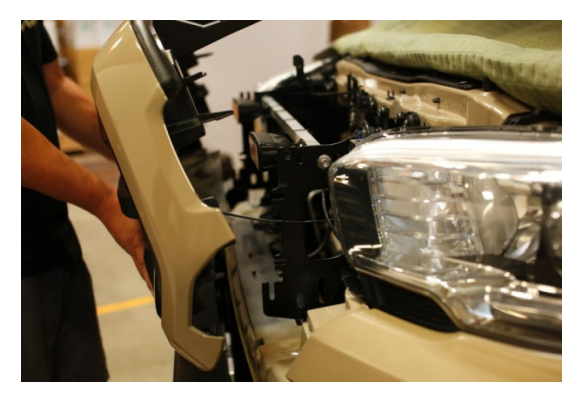
Step 4: Remove front grill and place in a safe place