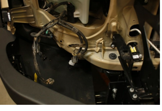
Step 13: Install Anzo headlight