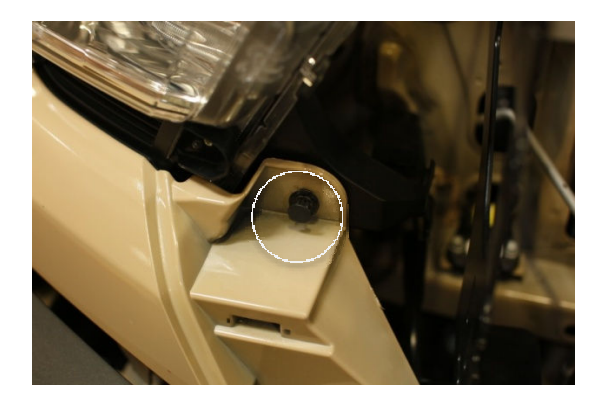
Step 5: Remove plastic tabs from each headlight