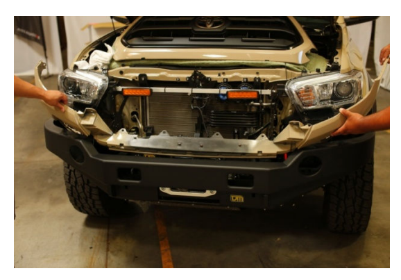
Step 9: Now remove bumper *Customer's Tacoma has aftermarket bumper, you will have to loosen the 8 bolts located under the bumper*