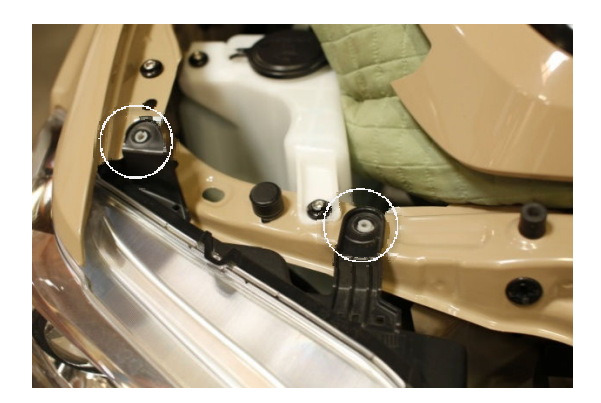
Step 10: Remove two top 10mm bolts from headlight (Repeat process on other side)