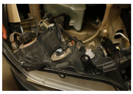
Step 12: Disconnect all wiring connections from headlight and remove headlight (Repeat process on other side)