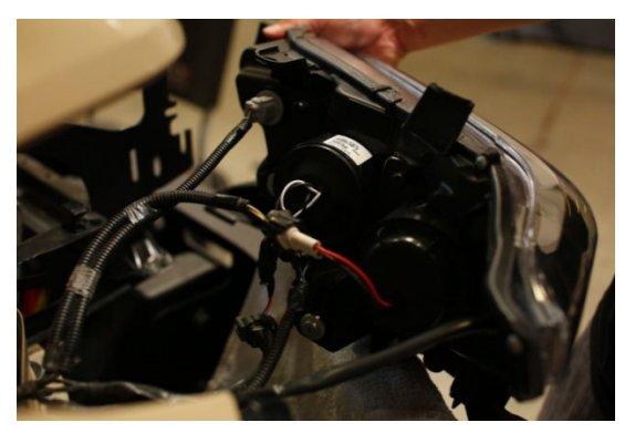
Step 14: Connect all connections into new Anzo headlight (Repeat process on other side)