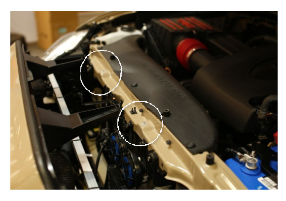
Step 3: Remove two 10mm bolts from top of grill