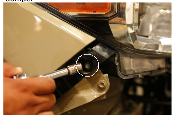
Step 11: Remove fender side clip by removing one 10mm bolts (Repeat process on other side)