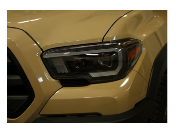
Step 15: Check fitment of headlight