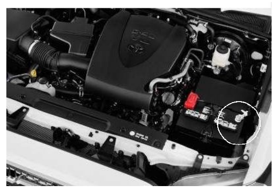
Step 1: Open hood and disconnect negative lead cable from battery