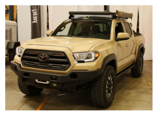
Tools required: 10mm socket, Flat head screwdriver, Panel Popper

Chino, CA 91710 Description: Toyota Tacoma Headlight 16-17