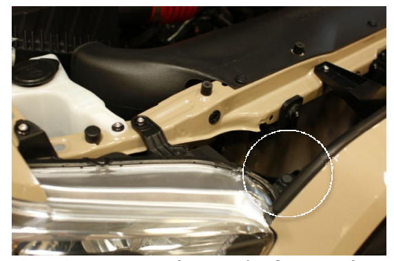
Step 2: Remove plastic tabs from each headlight